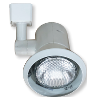
NTH-124W White Cone