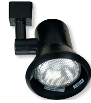
NTH-124B Black Cone