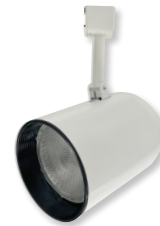
NTH-106W/A White Finish