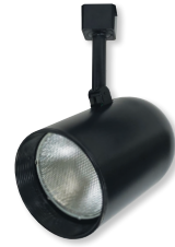
NTH-106B/A Black Finish