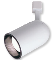
NTH-105W White Roundback Cylinder with Black Baffle