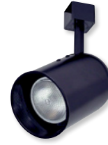
NTH-105B Black Roundback Cylinder with Black Baffle