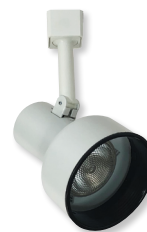
NTH-103W/A White Finish