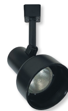
NTH-103B/A Black Finish