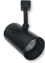
NTH-101B/A Black Finish