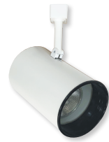
NTH-101W/A White Finish